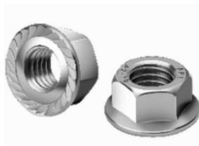
Hex Flange Nut