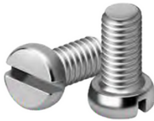
Slotted cheese Head Screw