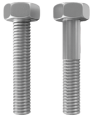
High Tensile Hex Bolt

U Bolts & J Bolts: Perfect For Pipe And Structural Support.