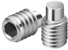
Hex Socket Set Screw - Dog Point