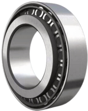
Tapered Roller bearings

Roller Bearings Distribute Loads Across A Larger Surface Area, Offering Higher Load-Carrying Capacity.