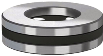
Cylindrical Roller Thrust Bearings