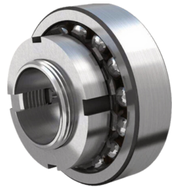
Self-Aligning Ball Bearings