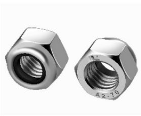
Hex NYLOCK Nut