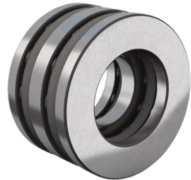
Thrust Ball Bearings

Our Bearings Are Trusted Across Industries For Their Ability To Reduce Friction, Enhance Performance And Ensure Smooth Operations.