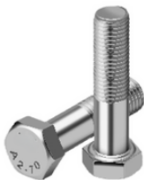
Hex Head Bolt Half Thread