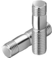
Stud rod both side threaded