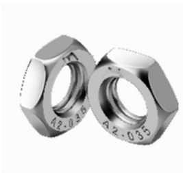
Hex Lock Nut