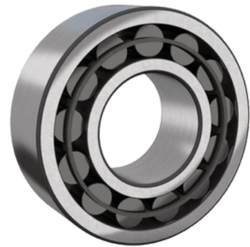
Thrust Ball Bearings