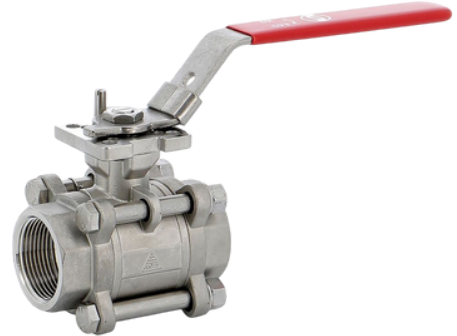
3 Pieces Stainless Steel Ball Valve