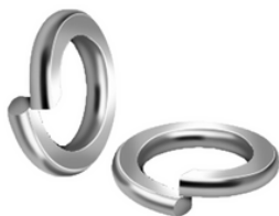
Spring Lock Washer