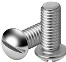
Slotted Round Head Screw