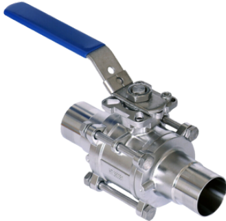
High Pressure Ball Valves