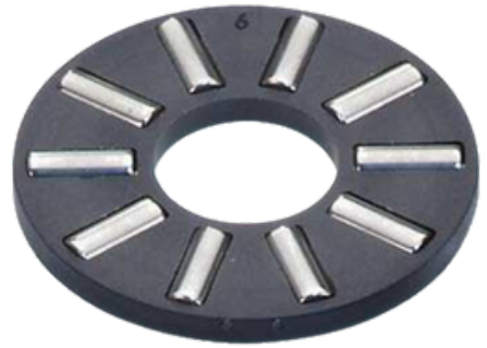
Needle Roller Thrust Bearings