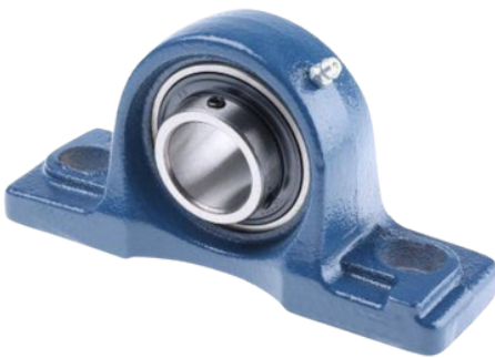
Pillow Block Bearings

Spherical Bearings Allow For Angular Misalignment, Making Them Suitable For Systems Requiring Flexibility And Durability.