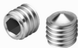
Hex Socket set Screw- Cone Point