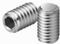
Hex Socket Set Screw- Flat Point