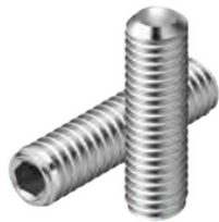
Hex Socket set Screw -Cup Point